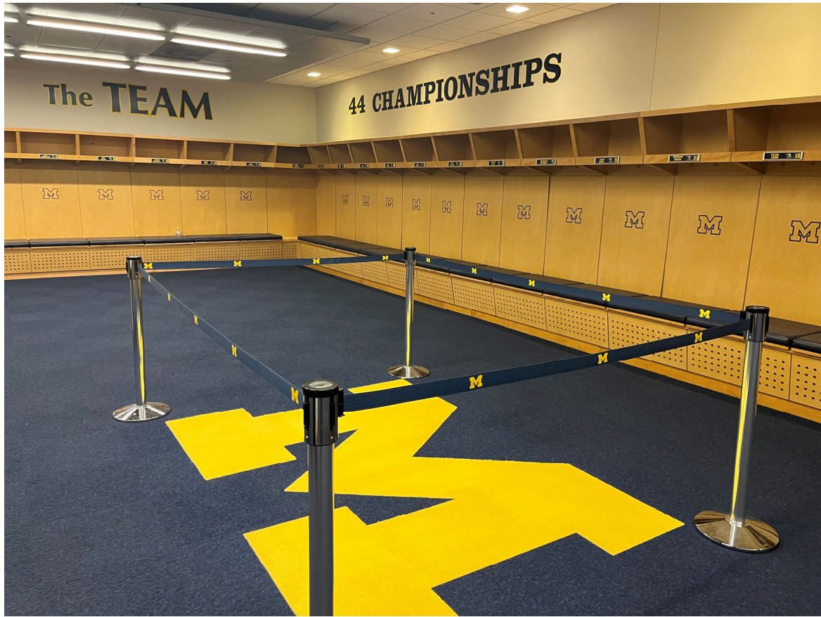
The Michigan locker room and football field during the tour